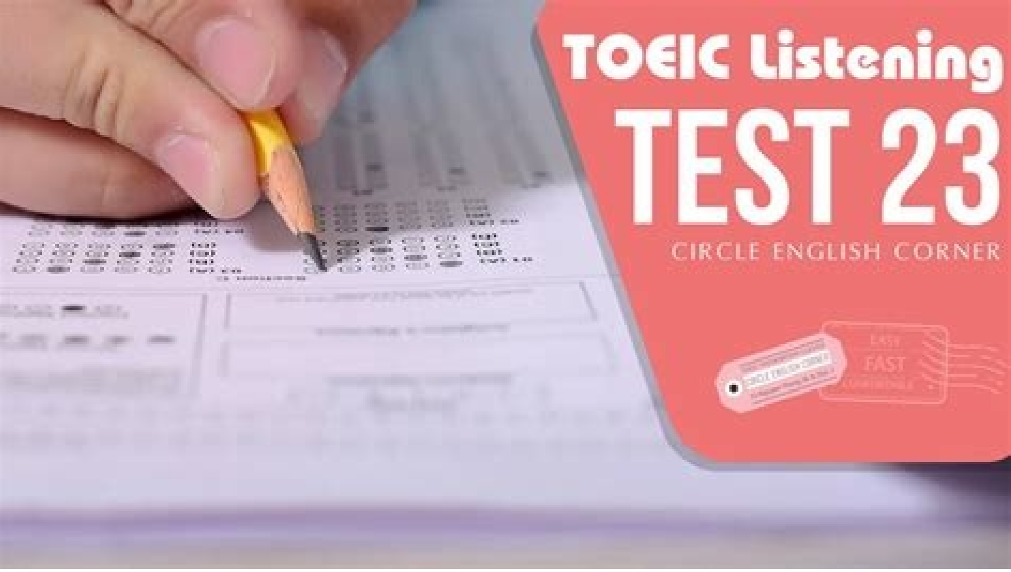
Sample of IELTS answer sheet. IELTS sample answer sheet 2020. IELTS filled answer sheet example. Sample answer sheet for IELTS reading. Sample answer sheet for IELTS listening.